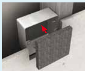
Step 1: Fix Intumex® AX into electrical box