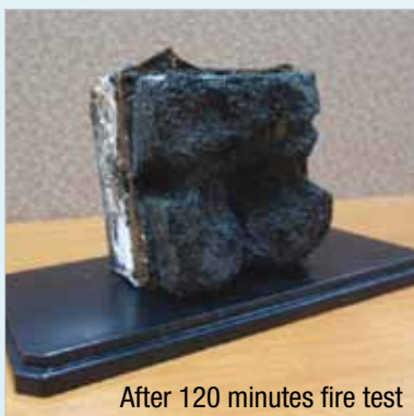
After 120 minutes fire test