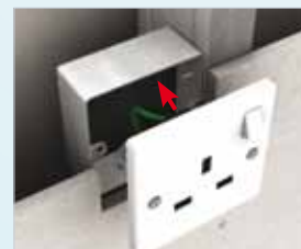
Step 3: Fix the cover in place