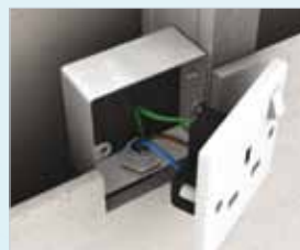
Step 2: Connect the electrical cables